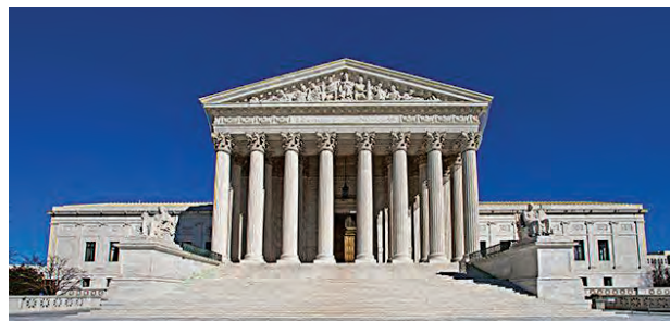
Supreme Court of the United States of America

But why does the Judiciary have this power? Both the Executive and the Legislature are involved in the process of law-making. It would be highly inappropriate to give them the power to examine whether the laws that they have made are consistent with the Constitution or not. It is likely that they would be biased while doing so. The Judiciary is not involved in any way in the law-making process. It is an independent body. Hence it has been assigned this power.